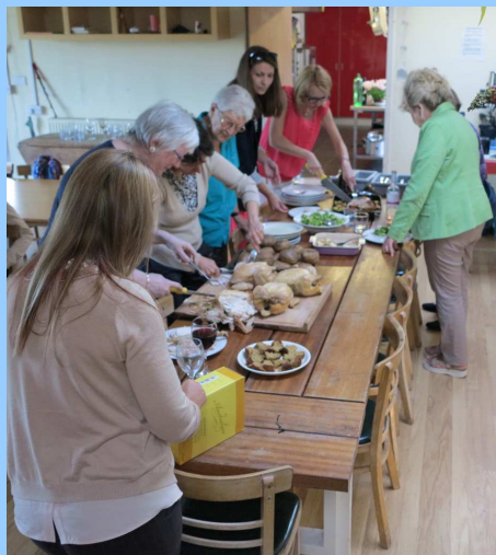
Preparing a common meal at Laughton