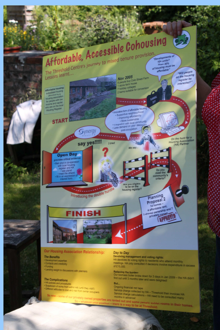
Threshold Centre map