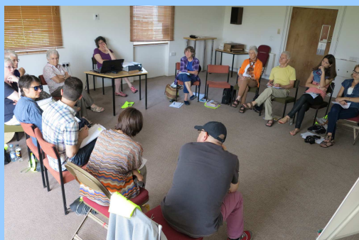
Co Elderly project working group