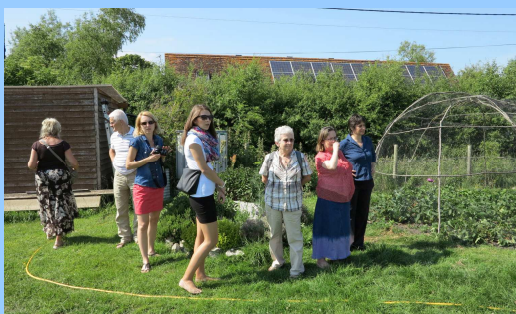
In the garden of Threshold

The meeting officially end on the 7th of July.