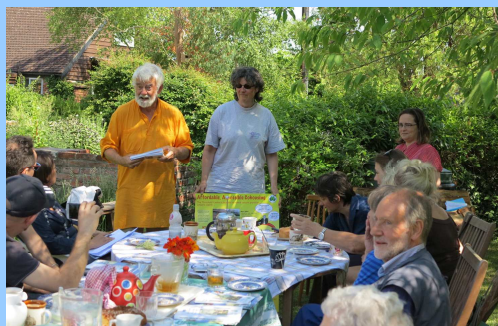
Coffee break at Threshold

The second day were strictly business. For couple hours we were talking about project logo, reports, next meetings. Kollektivhus NU (P4) from Sweden presented ppt presentation regarding the final Report about collaborative housing experiences for seniors with high dependency in the 4 involved countries and Active Senior Foundation from Poland (P3) presented their ppt presentation regarding the final Report about social policies for high dependency seniors. At the meeting we also agreed on "Business Plan for Collaborative housing for seniors with high dependency" and "Info-training model and related interviews". All Partners also agreed that the next meeting will take place in February 2014 in Sweden and the last one will be in Poland.